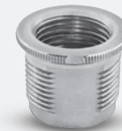
BREECH LOCK BUSHINGS Perfect with Lee Lock Rings 90600 2 Pack

You may want bushings. Breech Lock bushings fit all Lee Breech Lock presses. Allows instant, accurate die changes.